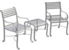
Side Table + 2 Carver Chairs ODL-147