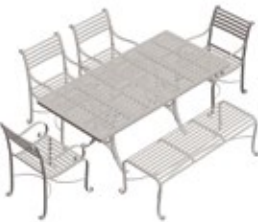
Table 1.8m L + 4 Carver Chairs & 3 Seat Backless Benches ODL-122