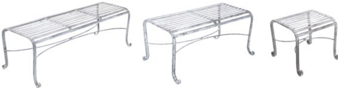
3 Seat 1.37m W x 58cm D x 44cm H • 20kg ODL-103