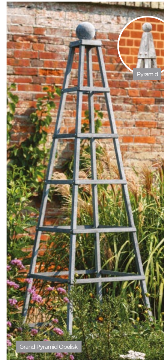
Grand Pyramid Obelisk

Grand Round Column Obelisk - Box Section Steel 2.28m H x 0.65m Dia. HAND ETCHED ARC-897