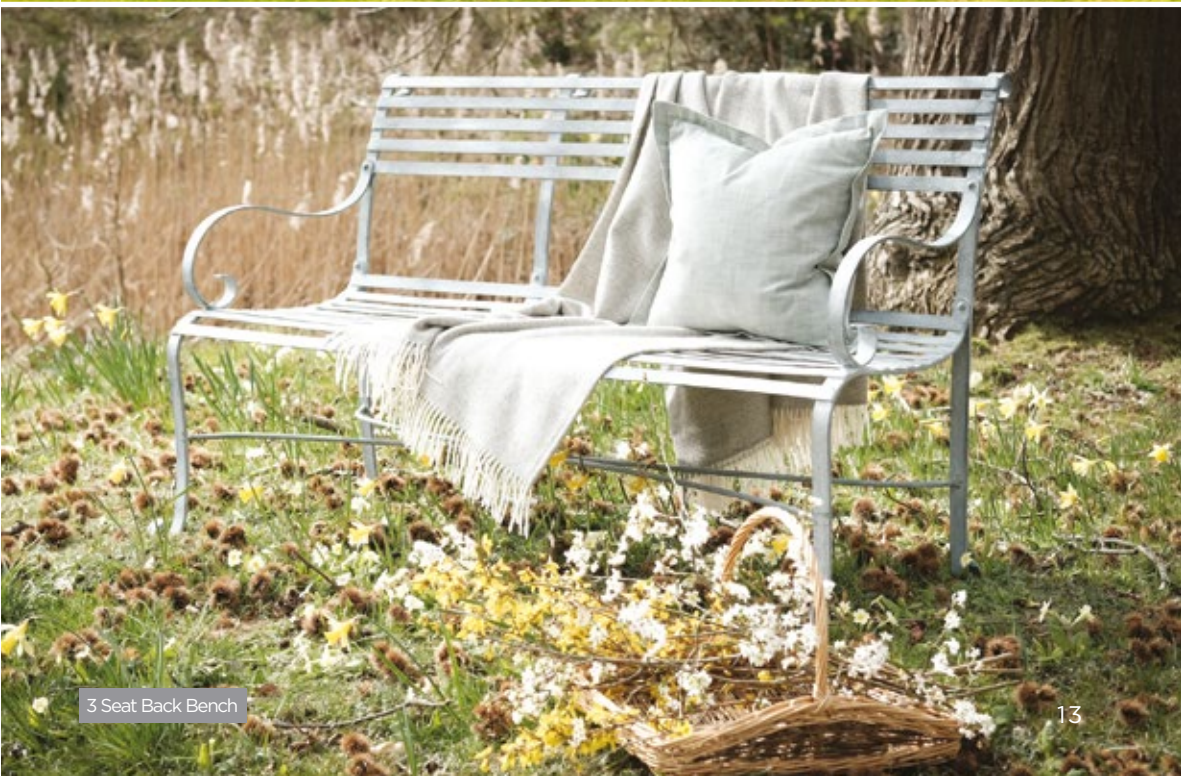
3 Seat Back Bench