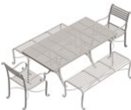
Table 1.8m L + 2 x 3 Seat Backless Benches & 2 Carver Chairs ODL-124