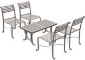
Table 1.1m L + 4 Side Chairs ODL-113