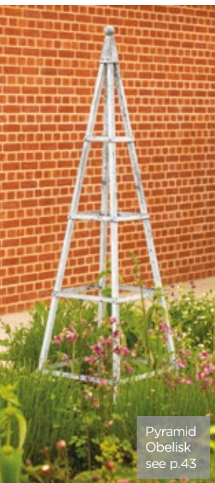
Pyramid Obelisk see p.43

Borders and walls can be brought to life too with favourite plant varieties intertwining with the decorative handcrafted framework of obelisks, plant supports and trellis. An enduring look that will provide support for years to come.