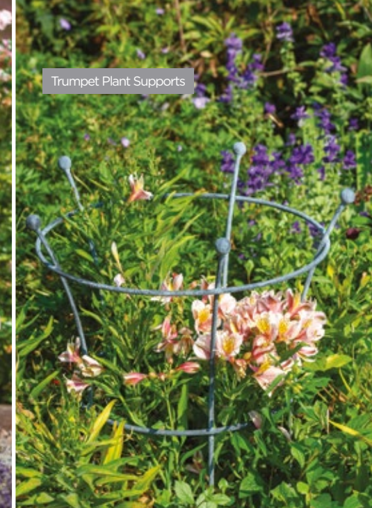
Trumpet Plant Supports