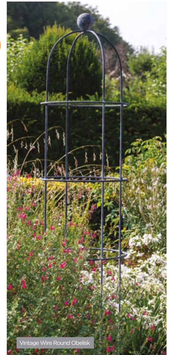
Vintage Wire Round Obelisk

Grand Pyramid Obelisk (main) - Box Section Steel 2.5m H x 0.77m W. HAND ETCHED ARC-899