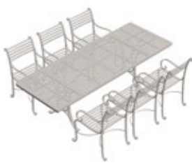
Table 2.4m L + 6 Carver Chairs ODL-125