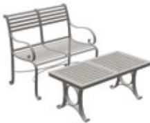
Table 1.1m L + 2 Seat Back Bench ODL-108