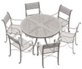
Table 1.3m dia. + 6 Carver Chairs ODL-105