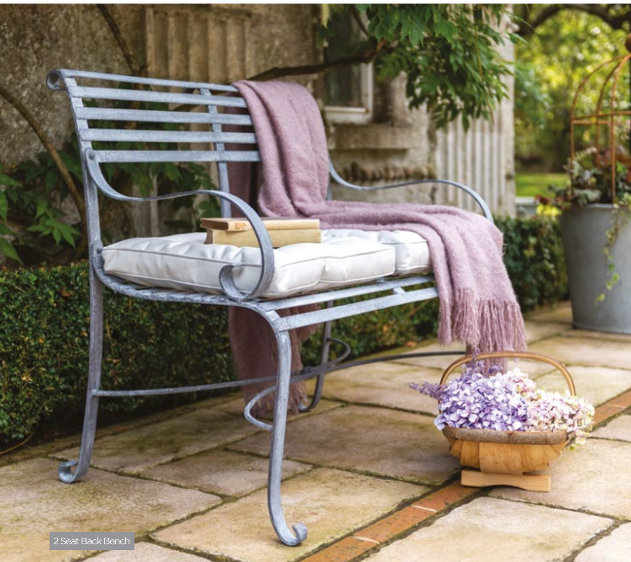
2 Seat Back Bench