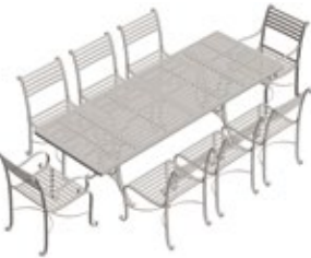
Table 2.4m L + 2 Carver Chairs & 6 Side Chairs ODL-128