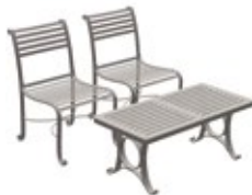
Table 1.1m L + 2 Side Chairs ODL-114