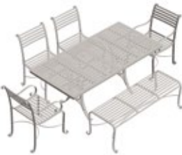
Table 1.8m L + 2 Carver Chairs, 2 Side Chairs & 3 Seat Backless Benches ODL-123