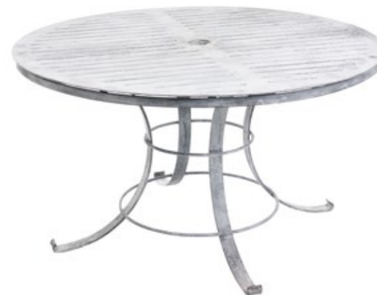
ROUND DINING TABLE

1.8m L x 90cm D x 73cm H • 92kg ODL-094 2.4m L x 90cm D x 73cm H • 120kg ODL-095