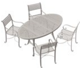
Table 1.8m L + 4 Carver Chairs ODL-115