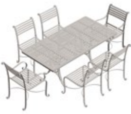
Table 1.8m L + 2 Carver Chairs & 4 Side Chairs ODL-121