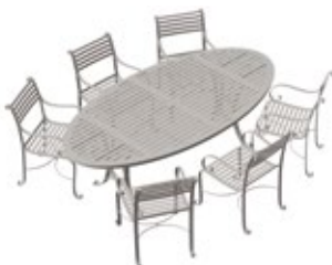
Table 2.4m L + 6 Carver Chairs ODL-117