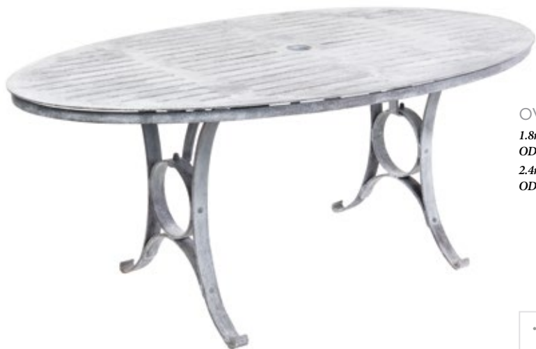
OVAL DINING TABLE

1.8m L x 1m D x 73cm H • 86kg ODL-133 2.4m L x 1.2m D x 73cm H • 110kg ODL-093