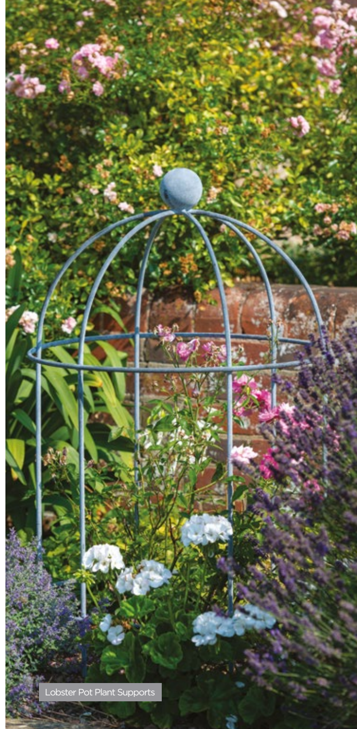
Lobster Pot Plant Supports