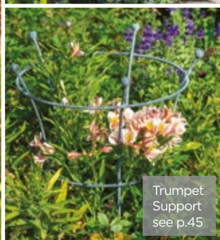
Trumpet Support see p.45