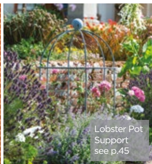
Lobster Pot Support see p.45