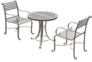
Table 75cm dia. + 2 Carver Chairs ODL-106