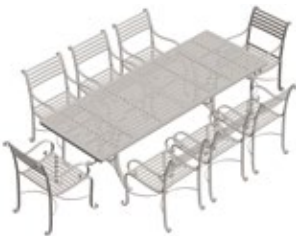
Table 2.4m L + 8 Carver Chairs ODL-127