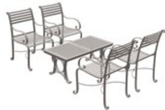
Table 1.1m L + 4 Carver Chairs ODL-111