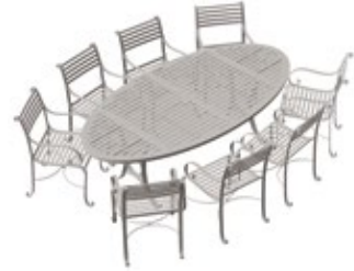
Table 2.4m L + 8 Carver Chairs ODL-118