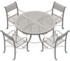
Table 1.3m dia. + 4 Carver Chairs ODL-104