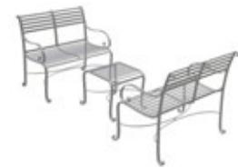
Side Table + 2 x 2 Seat Back Bench ODL-149