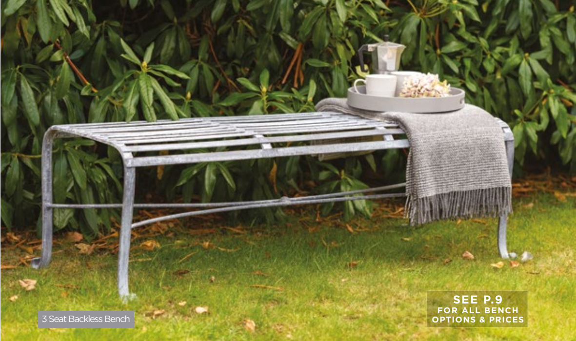
3 Seat Backless Bench