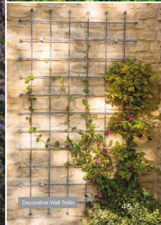
Decorative Wall Trellis