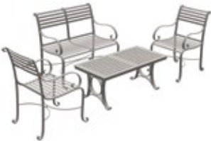
Table 1.1m L + 2 Seat Back Bench & 2 Carver Chairs ODL-109