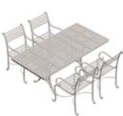
Table 1.8m L + 4 Carver Chairs ODL-119