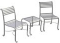
Side Table + 2 Side Chairs ODL-148