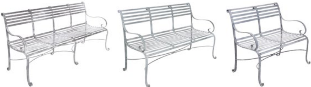
4 Seat 1.86m W x 68cm D x 88cm H • 39kg ODL-143