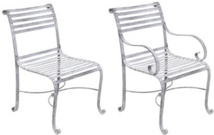
SIDE CHAIR 55cm W x 67.5cm D x 88cm H • 14kg ODL-099

Ergonomically superior seat and bench designs for ultimate comfort – with or without a cushion. Much thought has gone into the careful selection of the material sections used to ensure just the right amount of ‘give’ is coupled with the required structural strength. For comfort and aesthetics the back rest is curved and the seat base is tapered front to back, both using a lighter 3mm thick strip which provides essential ‘give’ and ‘spring’. The main framework features scrolled arms, back and leg detail using 8mm thick strip steel and has attractive curved bracing for strength and rigidity.