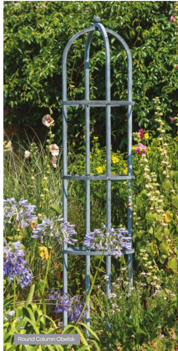
Round Column Obelisk

©The Royal Horticultural Society 2021. The Royal Horticultural Society, and its logo, are trade marks of The Royal Horticultural Society (Registered Charity No. 222879/SC038262) and used under license from RHS Enterprises Ltd.