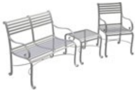
Side Table + 1 Carver Chair & 2 Seat Back Bench ODL-150