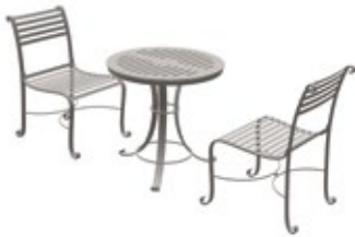
Table 75cm dia. + 2 Side Chairs ODL-107