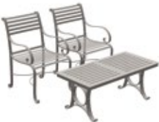
Table 1.1m L + 2 Carver Chairs ODL-112