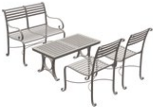
Table 1.1m L + 2 Seat Back Bench & 2 Side Chairs ODL-110