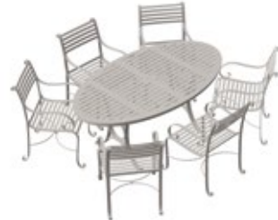
Table 1.8m L + 6 Carver Chairs ODL-116