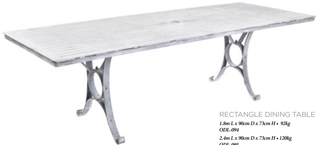
RECTANGLE DINING TABLE

1.8m L x 90cm D x 73cm H • 92kg ODL-094 2.4m L x 90cm D x 73cm H • 120kg ODL-095