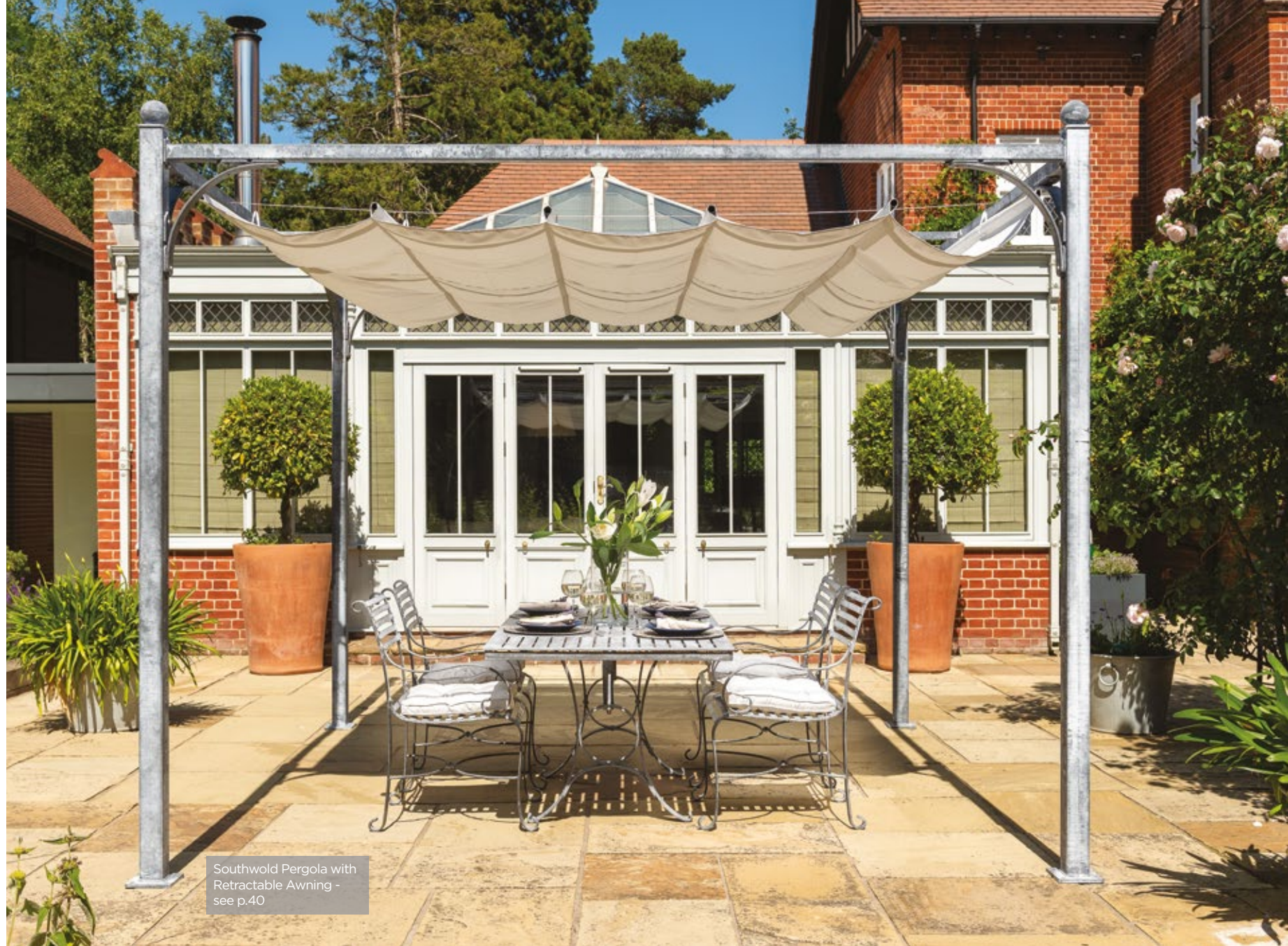
Southwold Pergola with Retractable Awning - see p.40